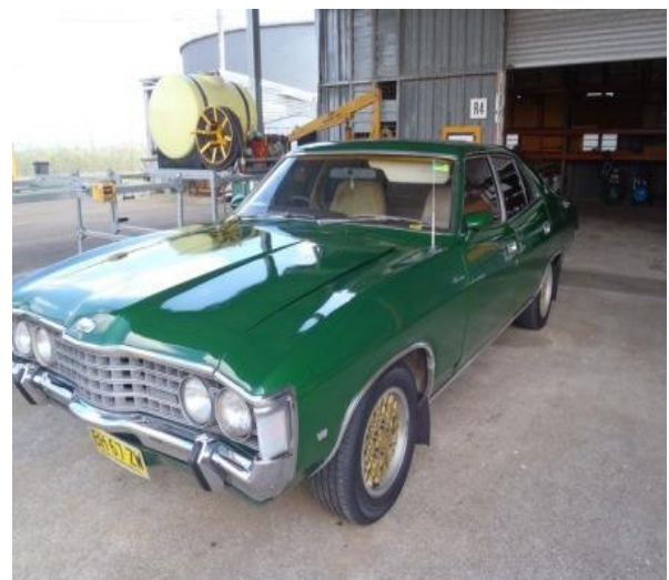
My new motorkhana car